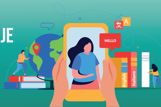
Figure 1. Educación General Básica.